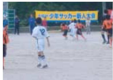
Kyuden Boys Soccer New Members Competition (Sasebo office)

In FY2005, at each branch office, 113 meets with 18 events were held and 53,211 persons participated.