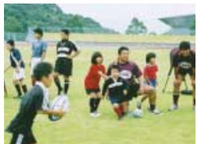
Rugby seminar by our company rugby team

We have made our rugby team our symbol sports from 2005. We have set our sights on entering the top national league in Japan. Part of our aspirations for this venture is to gain a devoted local fan base and encouragement from local people. As part of our commitment, we provide rugby coaching sessions in the local areas and participate in local events.