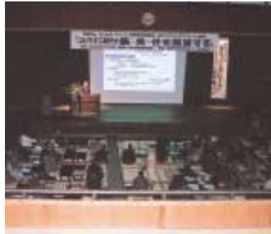
Fukuoka prefecture Izuka city "Machi-zukuri symposium" (the Kitakyushu branch office)

To actively promote the Kyushu area, a “Machi-zukuri symposium” (local citizens take an active role in urban functional improvement and management processes) has been held with the cooperation of local municipalities. Every year, we invite panelists and lecturers to discuss local topics and aspects of their local culture and debate on how to reinvigorate their area in hopes of creating a better town and better community.