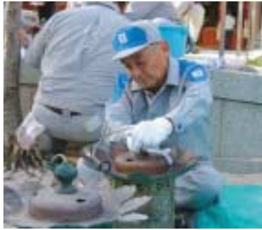
The "Kushida shrine cleaning activities" (Fukuoka branch) in which the president participated

As one of our main activities, we have an environmental month in June and a “Thank you campaign for customers” in October every year, where we focus on this campaign period to unite the management, and employees to clean the dry riverbeds, seashore, historical relics, etc.