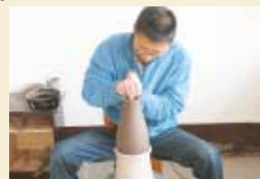
Training in China