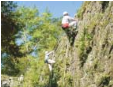
Stone wall cleaning of Oka castle mark (Takeda office)

As one of our main activities, we have a “Thank you campaign for customers”, and through this campaign, we service cultural assets, clean the light equipment at elderly persons’ homes and help them wire equipment, donate close-captioned TV tuners to schools for the hearing impaired, and perform other activities.