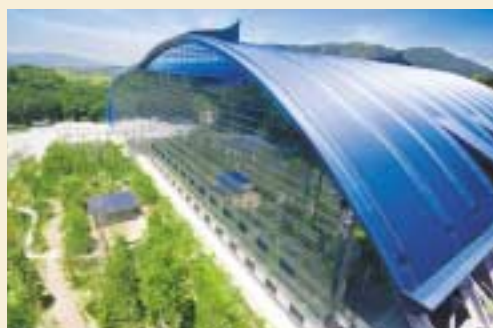
The Kyushu National Museum

This museum was established with the viewpoint of "grasping the formation of Japanese culture from the historical viewpoint of Asia" and Kyushu seemed worthy since this land was a window of exchange between Japan and Asia from ancient times. We hope that it becomes a new base of exchange with Asia and contribute to the culture of Kyushu.