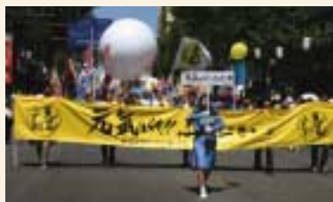
“Genki-bai Fukuoka” Dontaku guys