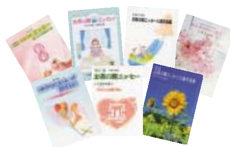
「Ochanoma Essay」 Winning a prize work collection

There were 4,457 applications in FY 2005.