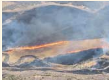
Burning of a field

Under the Ramsar Convention registration, burn-off activities will be more important, so we hope to continue with our activities for preserving the field with the cooperation of the local community.