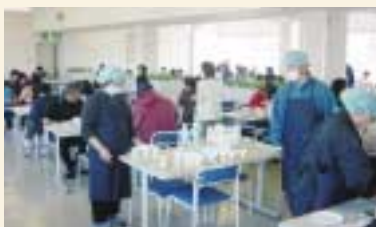
“Akari no Yakata” used for meals

Furthermore, in May 2005, the “Hakata Dontaku Port Festival” was held in cooperation with the local government and companies, along with the “Genki-bai Fukuoka” (Fukuoka dialect meaning, “Yes, I’m Fine Fukuoka!”) campaign. We proactively participated in reviving a city that wouldn’t let an earthquake bring it down.