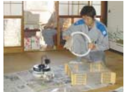
Lighting equipment cleaning service of elderly persons living by themselves (Takeo office)