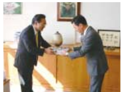
Donation of a television tuner for subtitle broadcast (Saga office)

We also take part in the Special Olympics in the Kumamoto area and the Oita International Wheelchair Marathon and support of the Iizuka International Wheelchair tennis tournament.