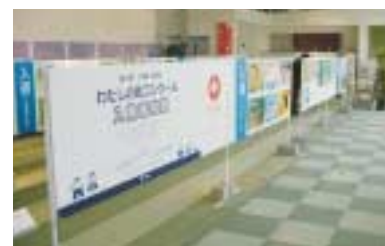
"My picture contest" Winning-a-prize work exhibition (Kagoshima branch)

At each branch office, collection of composition, the pictures contest, the music exhibition, and other original culture activities will be promoted and performed in the local areas by children of the next generation under high school.