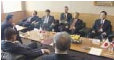
Periodic international exchange with Provincial Electricity Authority (Thailand)

With power utilities in U.K., France and South Korea, we have exchanged information such as the liberalization of the power market, and we have provided our expertise and know-how in the