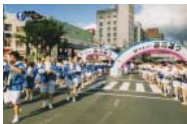
Wassho Hyakuman Summer Festival (Kitakyushu branch)

As part of local culture preservation, and in order to deepen bonds with the locals, 3,544 employees of each business place participated in the festival of their areas in FY 2005. Our group companies also actively participate and manage a festival in their areas.