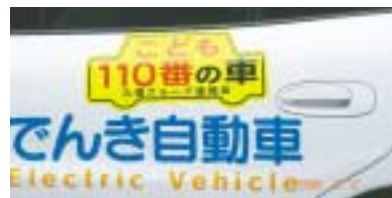
A "Children Emergency call" activity by a company car (Kagoshima branch)

Taking advantage of community-based business, we can promote local crime prevention activities with the local police, residents and other companies to create an environment where chil-