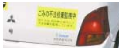
Stop illegal dumping sticker on a company car

When illegal dumping is discovered during a patrol, the "agreement about the measure against illegal dumping" was concluded with 77 local self-governing bodies, by 22 places of business.