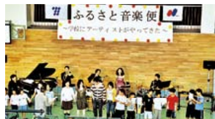
Nagasaki branch-sponsored hometown concert at primary school

Each branch office participates in its cultural activities for young generation such as pre-high-school students, ranging from essay and painting contests to musical performances.