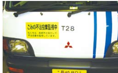
Sticker on vehicle of Nagasaki customer service office encouraging opposition to illegal garbage dumping

A total of 24 of our offices concluded agreements to inform 66 municipalities of illegally dumped garbage found on patrols.