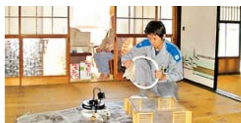
Takeo office worker cleaning lighting fixture at home of elderly person living alone

We also continue to support the Oita International Wheelchair Marathon and the Iizuka International Wheelchair Tennis Tournament.