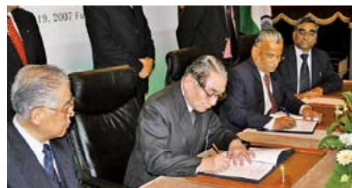
Signing exchange agreement with NTPC (India)

We exchange information on power market liberalization and other issues electric utilities in the United Kingdom, France, and South Korea. We maintain ties with power utilities in China, Thailand, and India by providing our expertise and know-how in power generation, transmission and distribution.