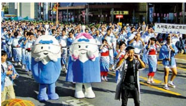
Ohara Festival in Kagoshima branch

Employees from our offices and Group companies help run local festivals to help preserve local cultures and deepen community bonds.