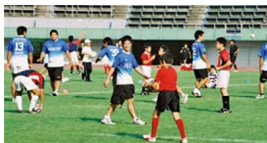
Boy's rugby clinic by our rugby club

Rugby is Kyushu Electric's symbolic sport. Our rugby team has earned the fervent community support, contributing to local communities by coaching at boy's rugby clubs and participating in matches.