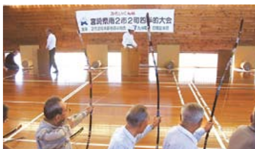
Nichinan branch-sponsored archery tournament

Through 80 offices, we supported 112 tournaments in 20 sports in which 49,101 people participated.