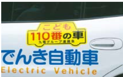
"Children's emergency call" activity using company car at the Kagoshima Branch

We take advantage of the closeness of our business to communities by assisting with local crime prevention activities around Kyushu. We work with communities, other corporations, and the police on patrols and other initiatives to safeguard children from crime.