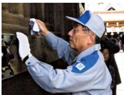
Kyushu Electric's president helps Fukuoka Branch personnel clean Kushida Shrine

Executive Managers and employees alike clean up riverbeds, beaches and historical sites, mainly during Environment month in June and during the customer thanks campaign in October.