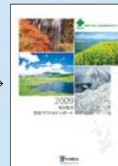
2009 Kyushu Electric Power Environmental Action Report

We report in detail on environmental initiatives