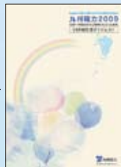
CSR Digest 2009