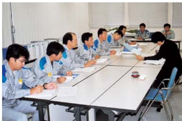
Regular audit of ISO certification at Omarugawa Hydro Power Plant Construction Office