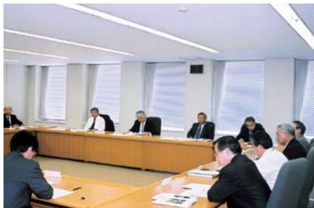
Environmental Committee (held on August 6, 2003)