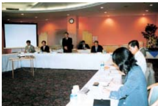
Kyushu Electric Power Environmental Advisory Council (held on July 22, 2003)