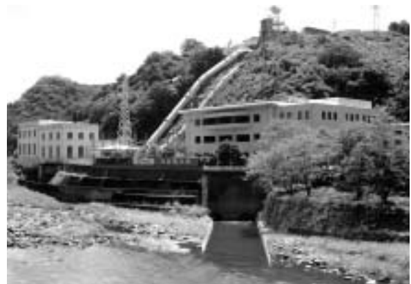
Onagohata Hydroelectric Power Station (Hita Power System Maintenance Office)