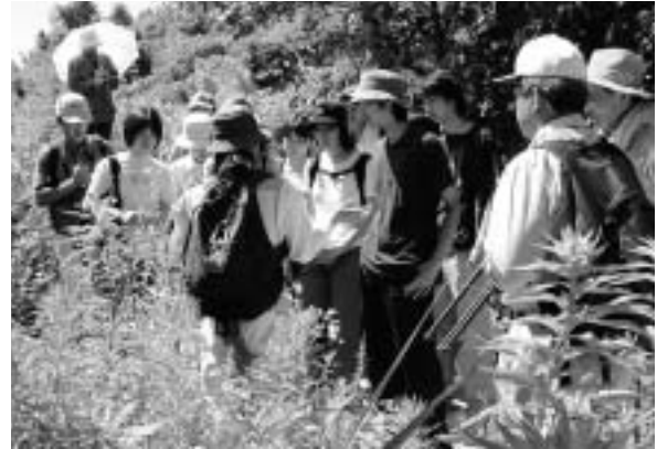
Nature watching in the Onagohata Hydroelectric Power Station dam area

In addition to the hydroelectric power facility tour, Kyushu Electric Power plans to organize activities on planting and undergrowth trimming, nature watching and hands-on forestry experience in order to support citizens' activities and school education on energy and the environment. Specific educational support programs are prepared by listening to the opinions and advice of experts from outside the company.