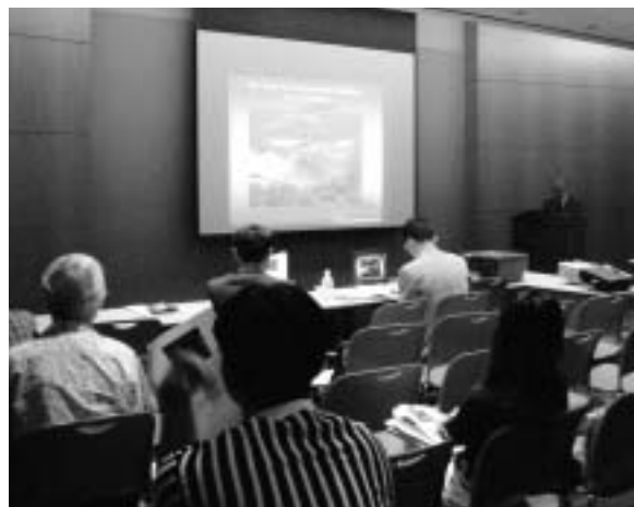
International Congress of Ecology

Kyushu Electric Power participated in the 8th International Congress of Ecology held from August 11 to August 18, 2002 in Seoul, South Korea, and made a presentation. The presentation discussed native plant forestation that was conducted during the construction of Genkai Nuclear Power Station, the Kyushu Homeland Forestation Program implemented with community cooperation, and environmental education conducted by taking advantage of the Onagohata Power Station dam area.