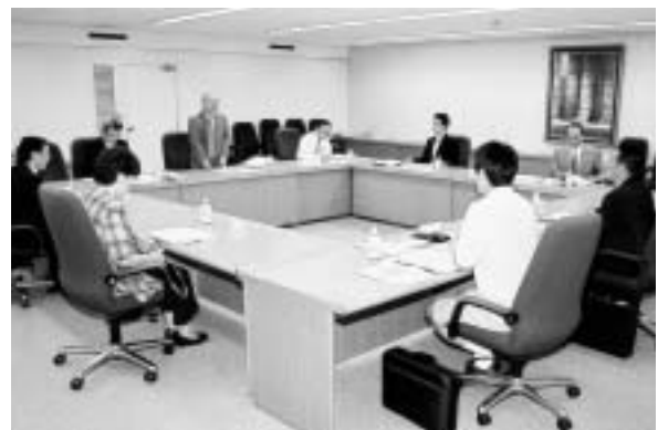
Conference with experts from outside the company (August 28, 2002)