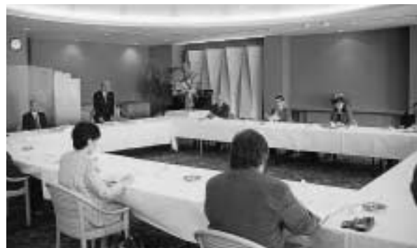
Kyushu Electric Power Environmental Advisory Council (held in August 31, 2001)

The Kyushu Electric Power Environmental Advisory Council is composed of eight experts in various fields and from each prefecture in Kyushu.