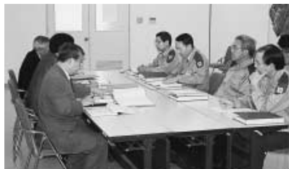
Inspection of ISO certification (Omarugawa Power Station Construction Office)

ISO14001 was granted to the Sendai Nuclear Power Station, Hitoyoshi Power System Maintenance Office and Omarugawa Power Station Construction Office (hydroelectric) in March 1999, March 2001 and August 2001, respectively. Kyushu Electric plans to deploy an ISO based system at Genkai Nuclear Power Station and in 17 power system maintenance offices.