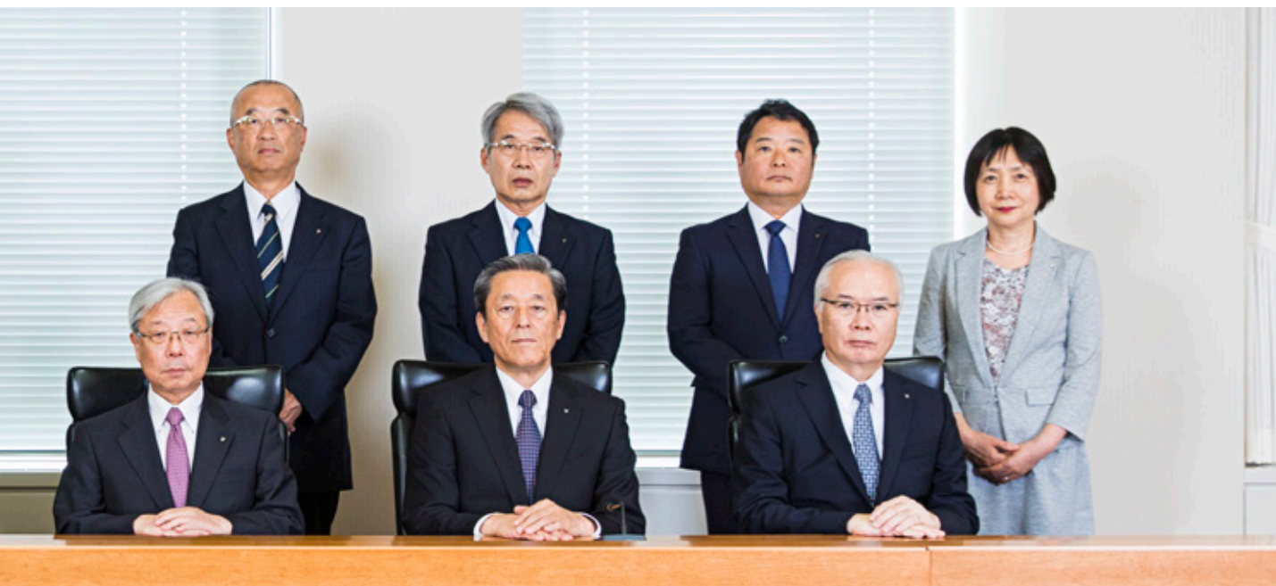
Board of Directors and Auditors