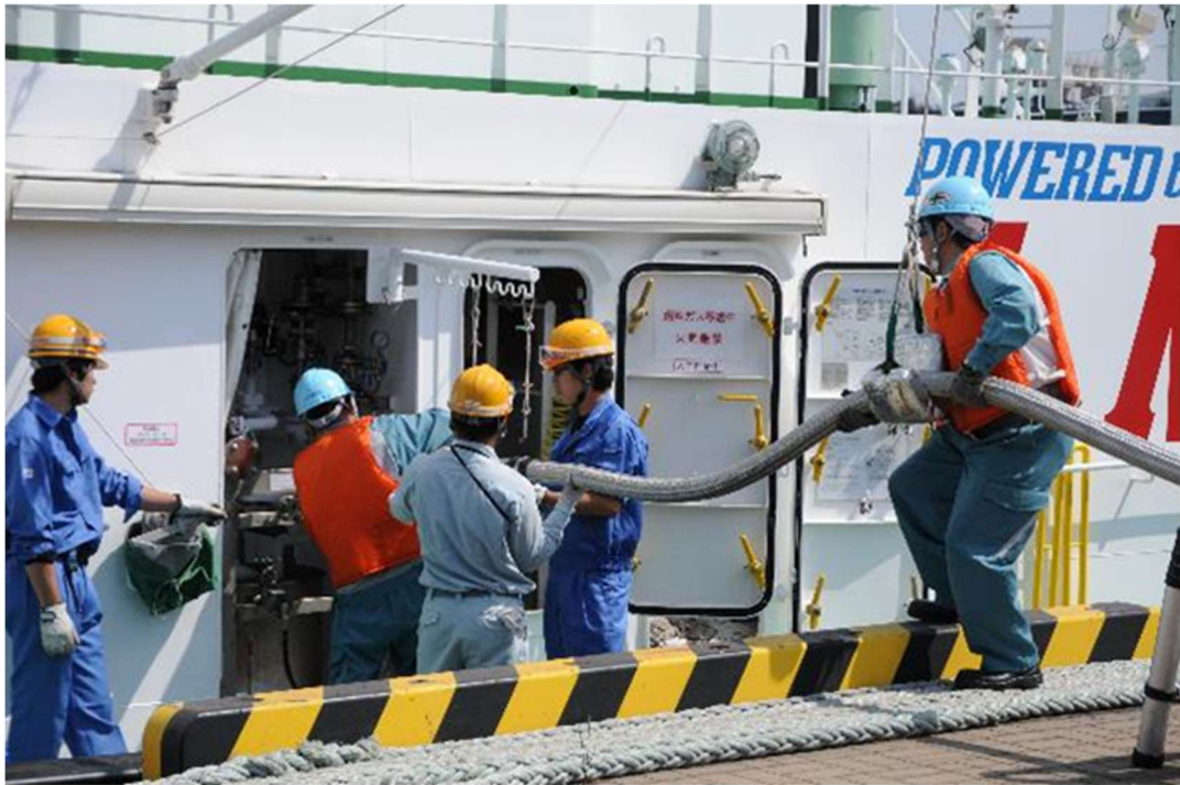
During bunkering operation