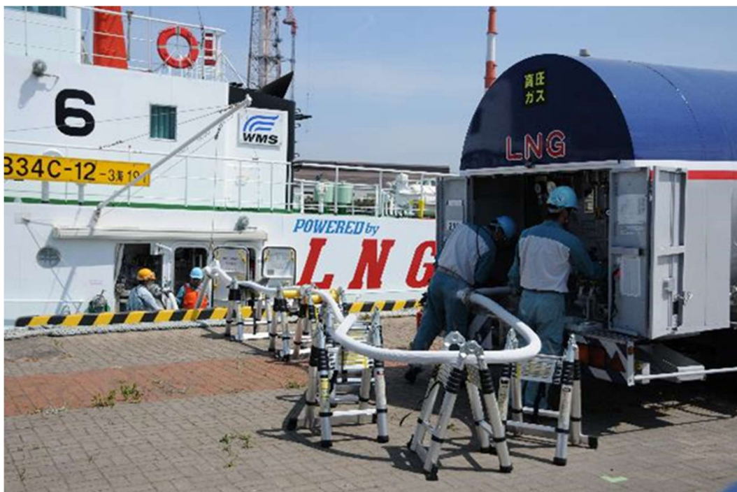
During bunkering operation

Since August 2018, the four companies have been in joint discussions on the commercialization of LNG bunkering, and this demonstration validates the feasibility of LNG bunkering in the area. Going forward, the four companies will utilize the experience gained from this operation to accelerate commercialization.