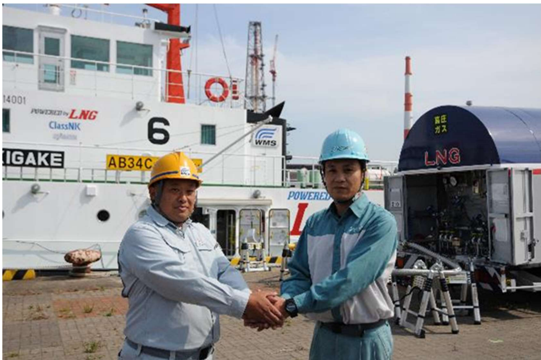
Sakigake captain with tank truck operator