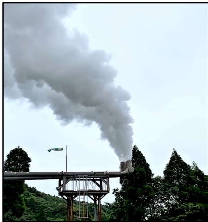
First well (Jun 2-Jun 7, 2022)