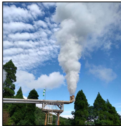
Second well (Jun 19-Jun 24, 2022)