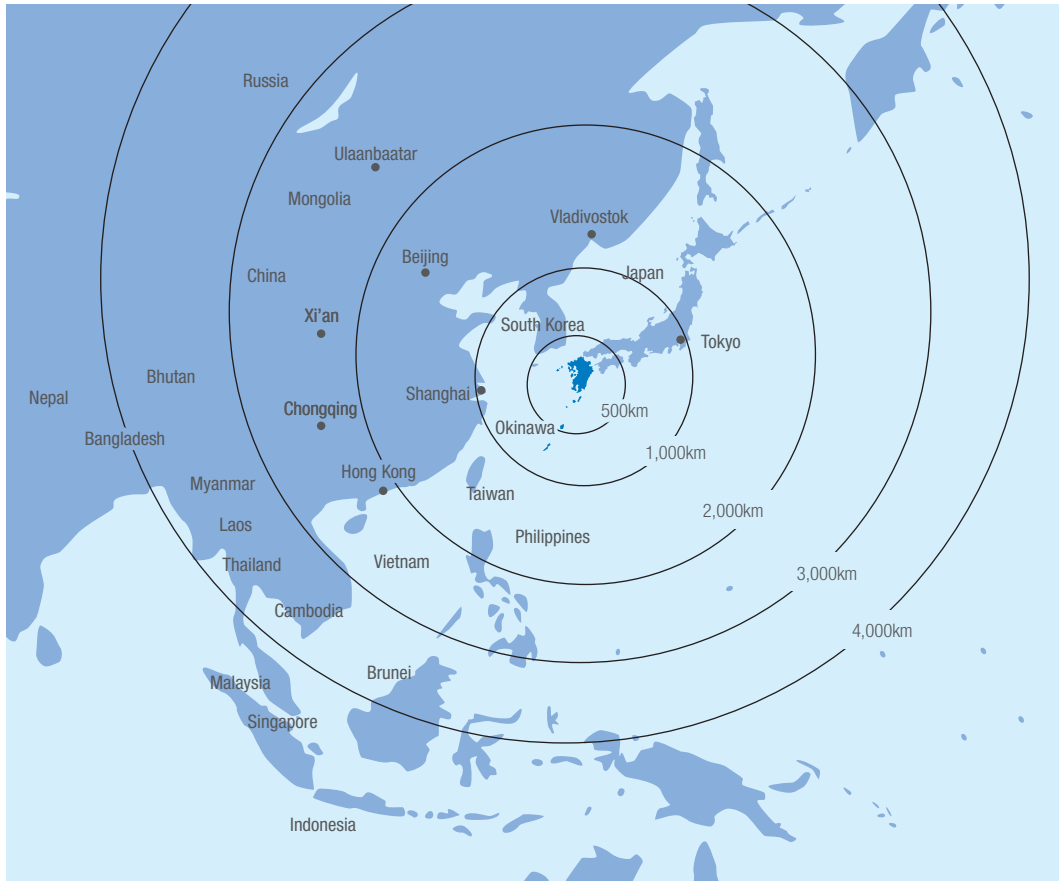
Source: Created based on "Profile of Kyushu 2022," Kyushu Economy International (KEI), Kyushu Bureau of Economy, Trade and Industry