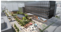
Project to utilize the former site of Niagemachi Elementary School, Oita City (Oita Prefecture; construction started July 2022)