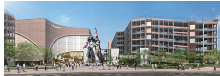
LaLaport Fukuoka (Fukuoka Prefecture)

The LaLaport Fukuoka shopping center opened in April 2022 on the site of the former Fukuoka City fruit and vegetable market. Taking advantage of its location near the airport, major train stations, and main roads, the facility will serve as a new hub in Fukuoka City that aims to increase the number of visitors and improving the flow of people throughout the city.