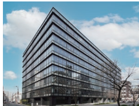
Fukuoka Maizuru Square (Fukuoka Prefecture)

The complex uses renewable energy-based electricity and has EV chargers installed, helping achieve a decarbonized society. Its spacious pedestrian walkways and other amenities also help generate bustling urban activity.