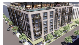
Development of ESG-friendly rental housing in southern USA (Joined May 2022)