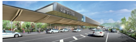
Kumamoto Airport privatized operations business (New terminal building to be in service in March 2023)