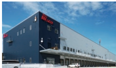
Fukuyama City logistics business (Hiroshima Prefecture; acquired March 2021)