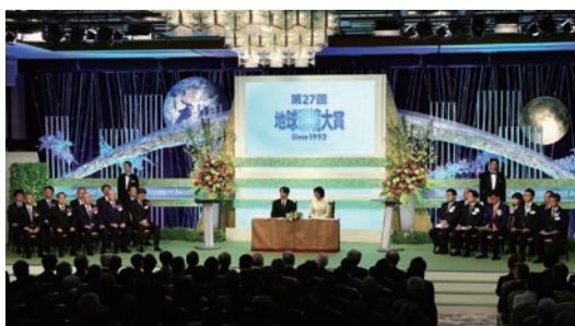
Awards ceremony (held at the Meiji Kinenkan in Moto-Akasaka, Tokyo)