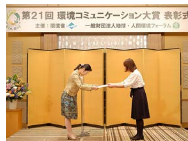
Koyo Denki Kogyo receiving its award