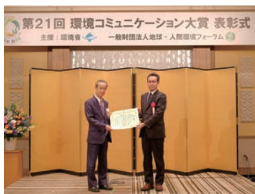
Kyushu Rinsan receiving its award

In addition, our group company Koyo Denki Kogyo Co., Ltd. was awarded the Prize for Excellence for the third consecutive year as a result of the prompt resumption of its environmental activities following the Kumamoto earthquake.